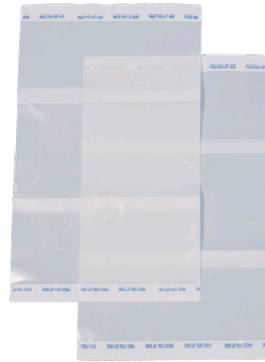
Transeal® MAXX or TR Drape