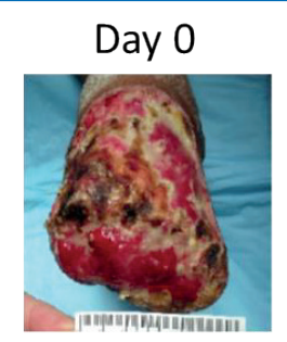
Wound Area: 41.84 cm<sup>2</sup> Granulation: 48.8%