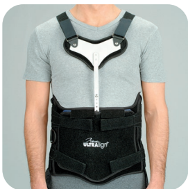
Sternal Pad Kit (SPK)