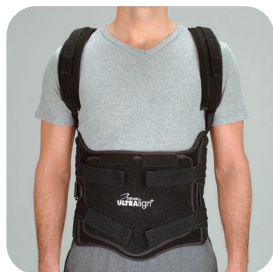
Dorsal Lumbar Extension (DLE)