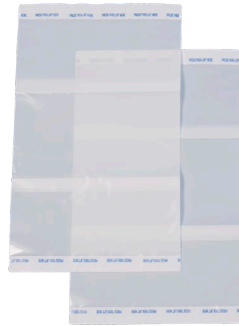
Transeal® MAXX or TR Drape