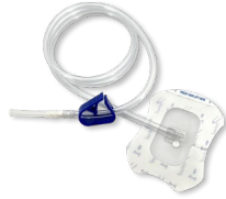
Prospera Propel™ P Dome